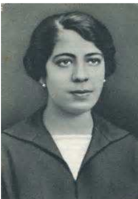
Blessed Victoria Diez Member, Teresian Association Martyr, Public School Teacher

This project which is on its 4 th year of existence, has been propelled by the inspirational legacy of three GREAT EDUCATORS: